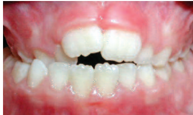
CROSSBITE OF BACK TEETH

Top teeth are to the inside of bottom teeth