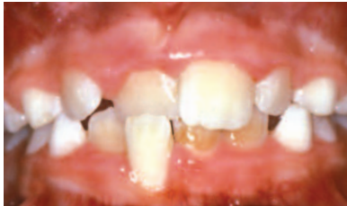
CROSSBITE OF FRONT TEETH

Malocclusions (“bad bites”) like those illustrated below, may benefit from early diagnosis and referral to an orthodontic specialist for a full evaluation.